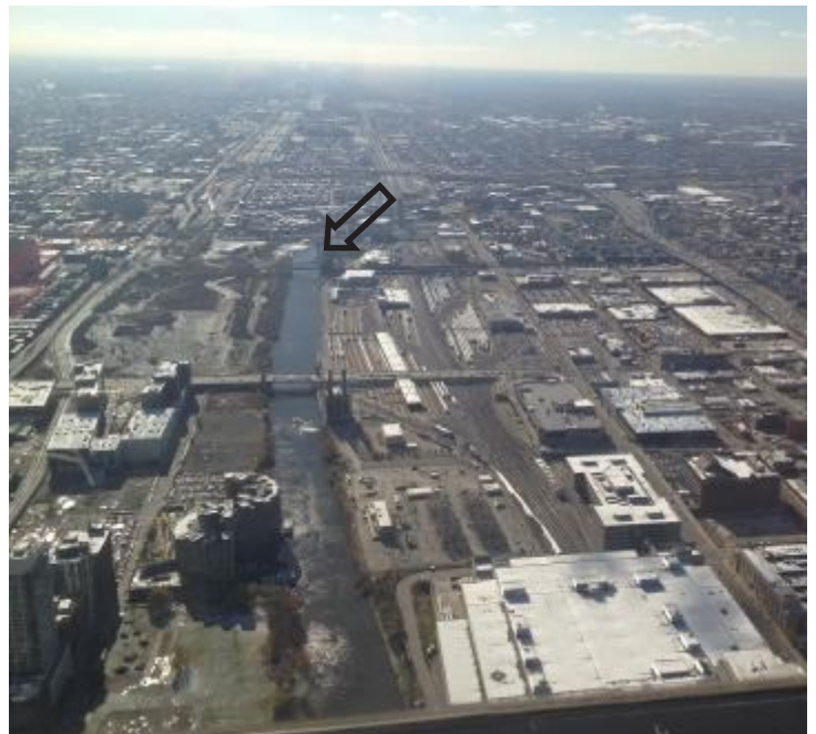
Left: Looking north up the Chicago River toward the Willis (Sears) Tower. Above: Reciprocal shot - looking south from floor 103 of the Willis Tower. Shot at left made from point of arrow.